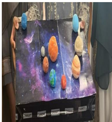
Group 2:(Maryam,Aisha,Noor,Ameya Alayna)

This group has worked really hard to make their project, using a big cardboard box which was painted black with 'stars' as the background and different sized foam balls as the planets. The 'planets' are attached to the top of the box by string. Their group was assigned to talk about Jupiter.