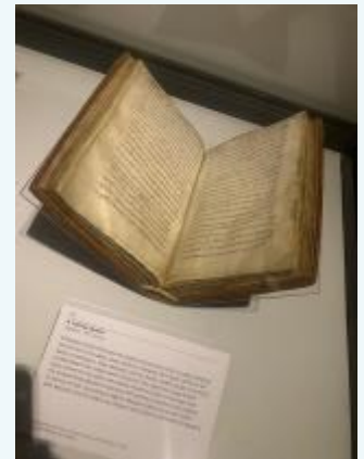
Ms Rahman English department

Students explored the rich history of Black writing and literature in Britain using digitised manuscripts from the Black Literature Timeline as well as manuscripts on display in the Treasures of the British Library gallery and sound recordings from the British Library collection. In addition, learners interrogated publishing practices and industry barriers Black writers have faced through the years.