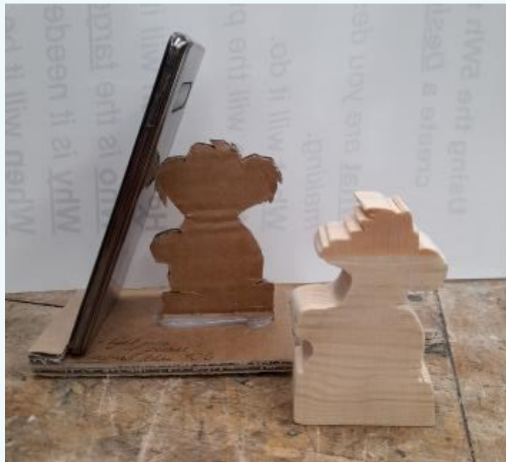
Humeirah's card model and device holder in progress