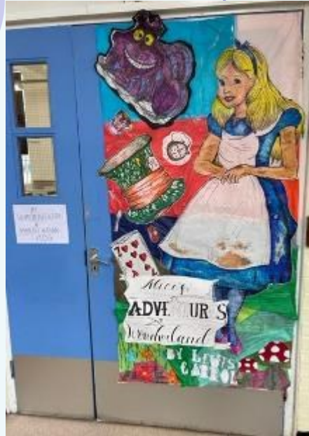
Right: Winning Door Decorating Entry 10G

The English department alongside the LRC set up a fun and quick activity for WBD. It was based on the legend of Ernest Hemingway winning a bet by writing a six word story, "For sale: baby shoes, never worn." An announcement of the competition was posted on the WBD google classroom and there were some wonderful entries. Here are a few below: