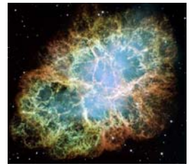
What is this nebula the remains of and what is being born here?