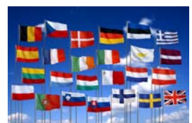
Which flags from the European Union do you recognize?