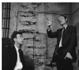
Crick and Watson—Two scientists, famous for what?