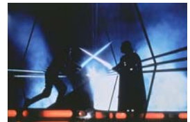
Which films are shown depicting the use of lasers?