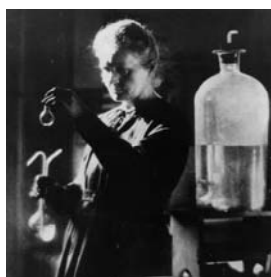
Who is this French speaking scientist and what is her nationality?