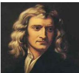
This scientist may have been able to help, can you name him?