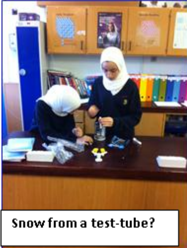
Snow from a test-tube?

So far this year we have packed the Lab with students from Years 7, 8 and 9. They have enjoyed a variety of experiences such as :