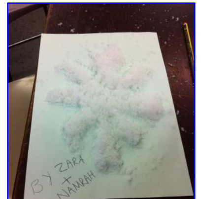
Snowflake or snowflakes or just "Fake" ?!

The club is also a place where students of different ages can talk about issues with one another, and also receive help with things like homework and careers.